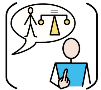
PSHE & Citizenship

EQUALS is extremely pleased to announce the availability of four revised Schemes of Work (SoW) specifically written for pupils with learning difficulties who are working below age related expectations. These four guides cover English, Maths, Science and PSHE & Citizenship and can be purchased singly or as a package.